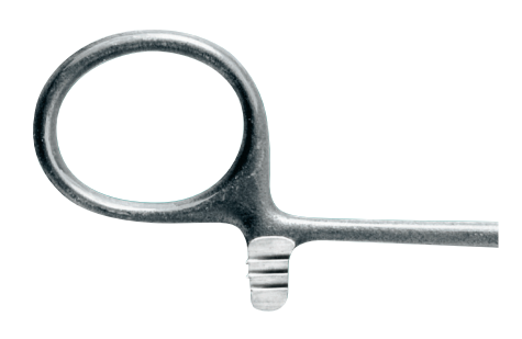
Step 7: Profile Grinding. After the forged parts are milled, they are ground on a rough stone grinding wheel. This step removes any excess material that may be remaining after the forging process.

Step 6: Jaw Tooth Milling. The annealed parts are then milled based on the requirements of the final instrument design. The individual parts comprising a two-part instrument are inseparably connected at the joint by pressing them together and then riveting.