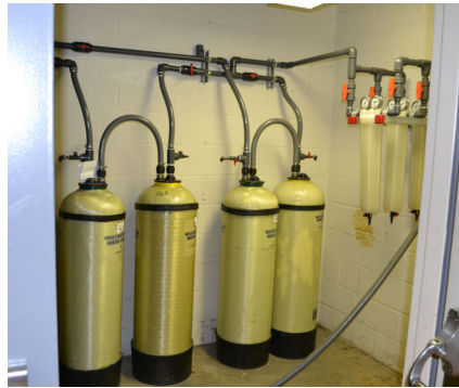
DI water system