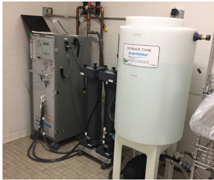
RO water system