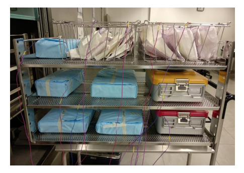
Figure 4: Example of a hospital load configuration with different medical devices and sterile barriers

Recent research provides additional evidence that pressure and temperature parametric values are not sufficient to demonstrate the presence of saturated steam required for spore inactivation with latent heat. The findings are related to steam quality supplied to the equipment and present on the load, which are not monitored by the sterilizer. Steam quality is affected by the load, meaning that saturation will change depending on the sterile barrier, device construction material and weight.