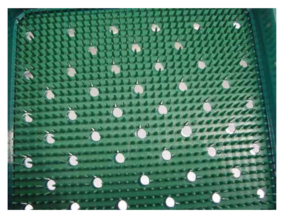
Figure 2: Silicone mat properly placed