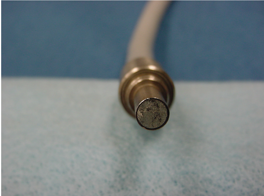
Figure 4: A light cable with broken fibers

inspecting the other end and looking for broken fiber optics. Broken fibers will appear as black dot or specks and will not be illuminated. Because the fibers are made of glass, they are very fragile and should be handled with care. Most light cords that have been used for any amount of time will have several broken fibers. A small amount of broken fibers may not affect the light output from the cable; however, when too many fibers are broken, the light output can start to diminish and the cord should be replaced. Figure 4 shows a light cable with broken fibers.