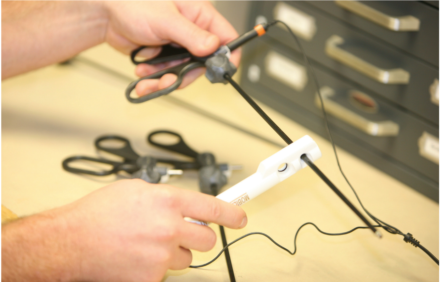
Figure 3: Current leak testers help identify insulation breaches that can jeopardize patient safety.

in the insulation. The manufacturer's IFU for insulation testing should be followed. Figure 3 shows a current leak tester in use.