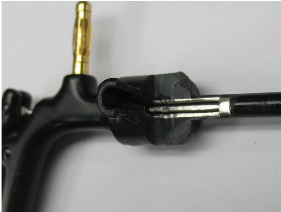
Figure 1: Dissected flushing port shows the intersection with the instrument shaft