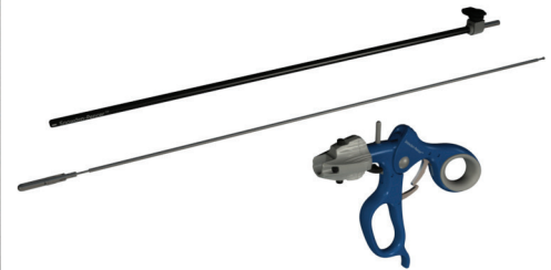
Figure 2: A third-generation “take-apart” laparoscopic instrument

There are three distinct generations of laparoscopic instruments. The first-generation laparoscopic instrument is designed as a single-piece instrument that cannot be disassembled. The