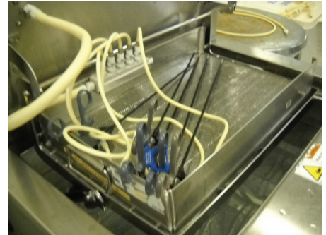
Figure 2: Irrigating instruments

many devices need to go through an ultrasonic cleaner. Once again, check the IFU for the proper chemical, dilution, time and the proper loading process for that device. Ensure the item is recommended for ultrasonic cleaning as some devices, such as chrome and laser-plated instruments, mixed metals and glass items, can be damaged by this process. Wood, cork, some plastics and other materials are also not recommended for ultrasonic cleaning.